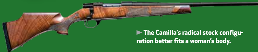
► The Camilla's radical stock configuration better fits a woman's body.