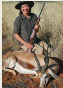
► The author used these guns on turkeys and African game.