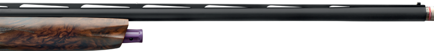
TRIWOOD™ ENHANCED TURKISH WALNUT STOCK